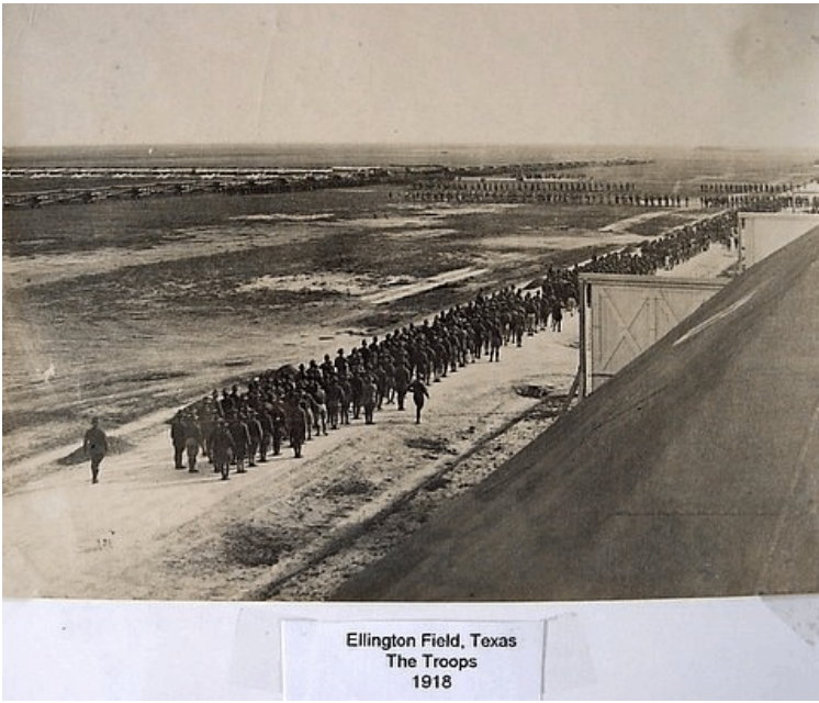
Ellington Field, Texas The Troops 1918