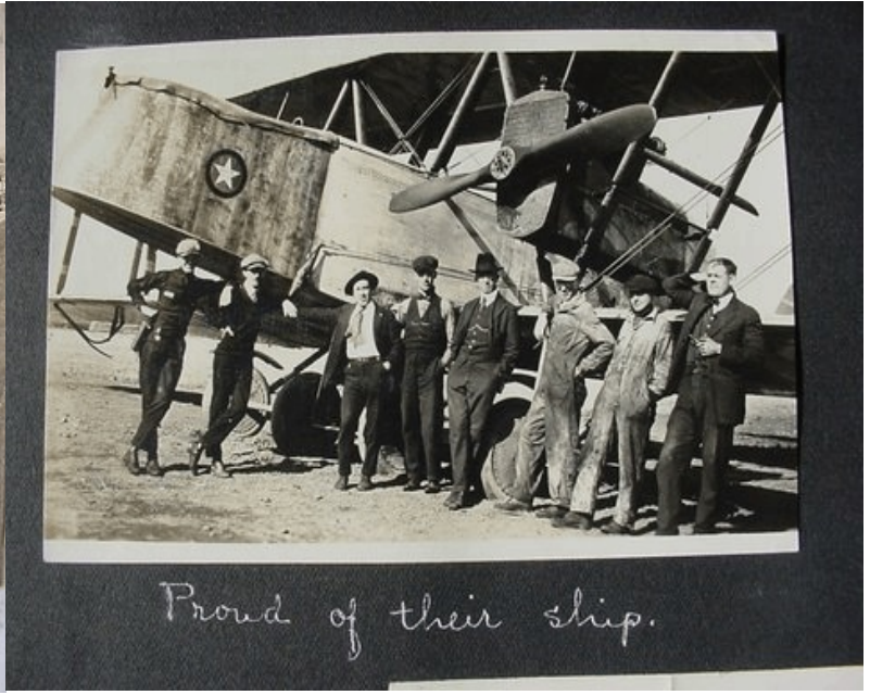
Proud of their ship.